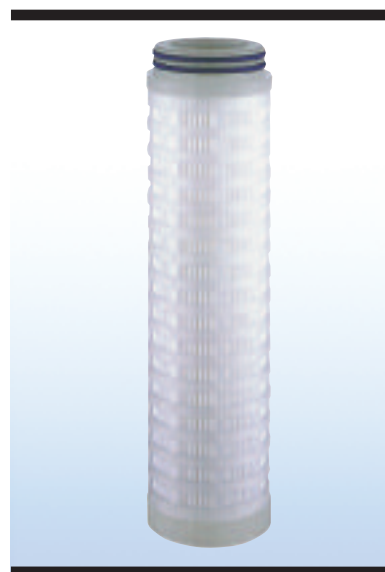
Ultrasulfomem® PF-PES for clear and sterile filtration of liquids with the lowest possible differential pressure